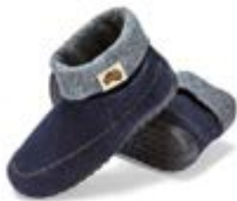
Navy & Grey Style # WWBOTHRO24