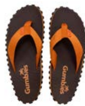
BROWN & ORANGE Style # FFDUC134