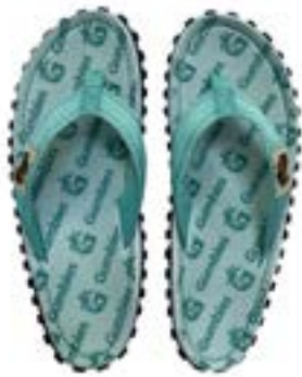
MINT MULTI LOGO