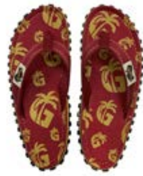
RED MULTI G