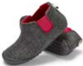
Charcoal & Red Style # WMSLBRU003