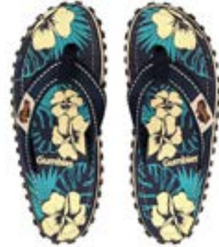
BLUE HIBISCUS Style # FFISL107