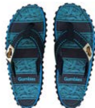
BLUE WAVES Style # FFISL110