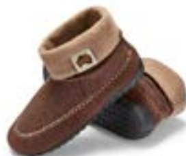
Chocolate & Cream Style # WWBOTHRO61