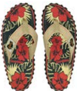
DENIM HIBISCUS Style # FFISL109