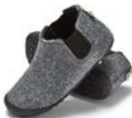
Grey & Charcoal Style # WWSLBRU014