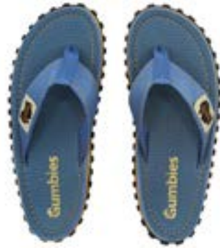
CLASSIC LT. BLUE