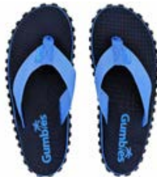
NAVY Style # FFDUC023