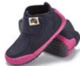
Navy & Pink Style # SLQU0025