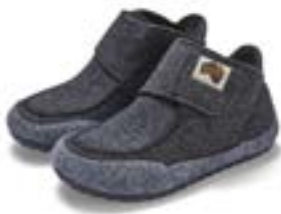
Charcoal & Grey Style # SLQU0137