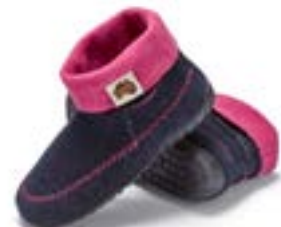
Navy & Pink Style # WWBOTHRO25