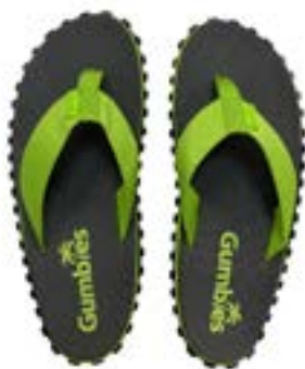
GREY & LIME Style # FFDUC135