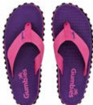
PURPLE Style # FFDUC031