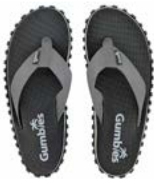
BLACK & GREY Style # FFDUC039