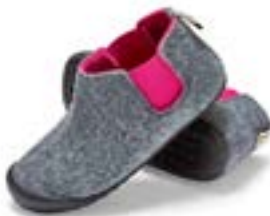
Grey & Pink Style # WWSLBRU015