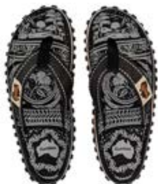
MIDNIGHT BLACK Style # FFISL108