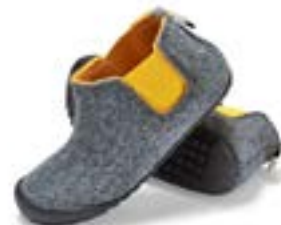
Grey & Curry Style # WMSLOUT062