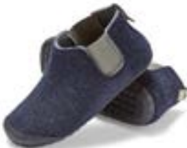
Navy & Grey Style # WMSLBRU024