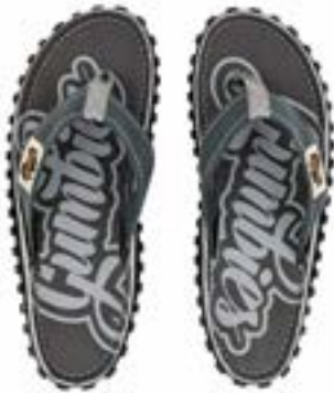
COOL GREY Style # FFISL005