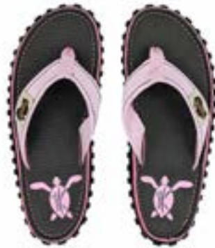
GREY TURTLE Style # FFISL012