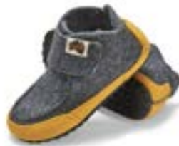
Grey & Curry Style # SLQU0063